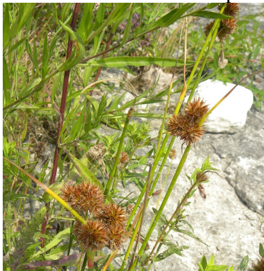
Torrey's Rush .